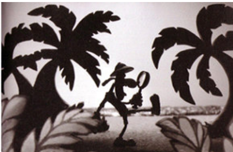
Festival nordijskih filmova u Beogradu Utorak, 3. februar 2009. 15:57

www.kcb.org.rs ; www.slowwwenia.com ; www.indexradio.com ; www.yellowcab.co.yu ; www.smedia.rs ; www.singidunumweekly.com ; www.fcs.co.yu ; www.studio-b.co.yu ; www.clubbing.rs ; www.ekapija.com ; www.nadlanu.com ; www.b92.net ; www.trablmejker.com ; www.usrbiji.org ; www.danas.co.yu ; www.glas-javnosti.co.yu ; www.karika.com (RSS); www.infobiro.tv ; www.beograd.co.yu ; www.sinemagija.com ; www.filmofili.com ; www.seecult.org , etc.