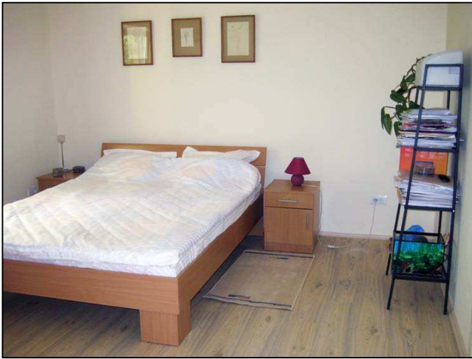
The first apartment, bedroom