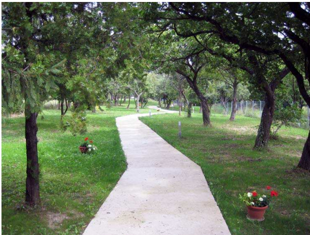
BKF European Residency, orchard