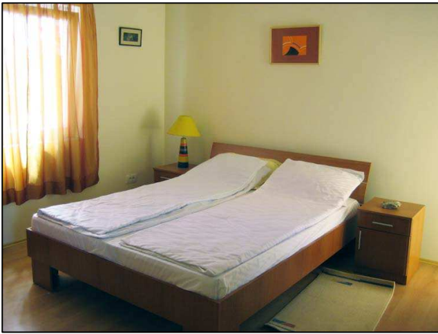
The second apartment, bedroom