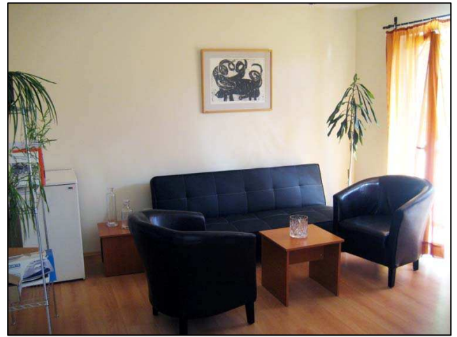
The second apartment, living room